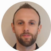
Smart Betting Club Owner/Founder https://smartbettingclub.com/